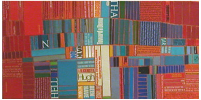
Laurie Frick, Blue Maesta , 2007, collage on linen, 8 X 16 in

Another viewpoint of the work suggests a Birdseye look at an urban landscape. In this is captured an urban haphazardness with all its imperfect beauty and an outlook that is cheerful